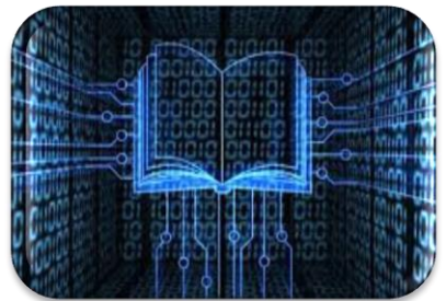
technologies and digital transformation